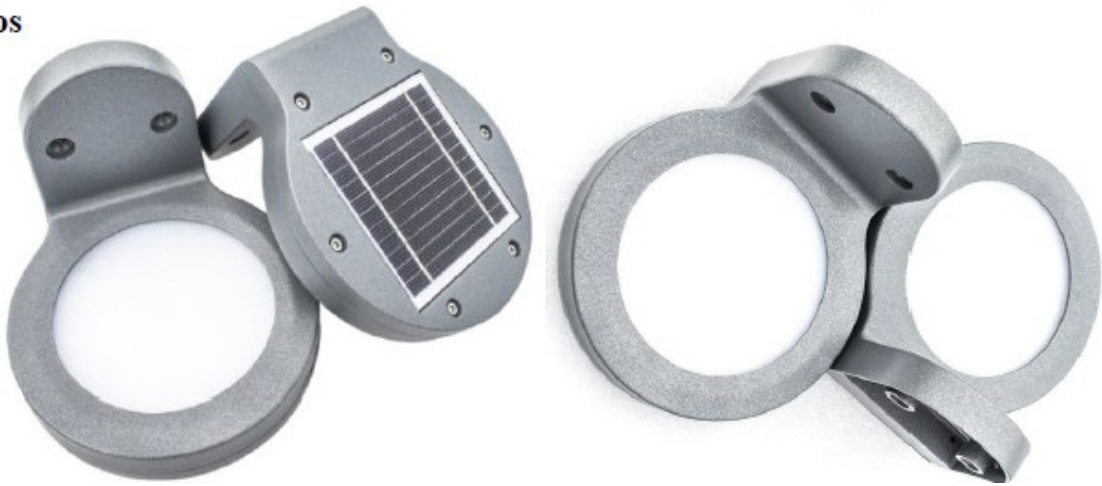
Die-casting Aluminum Housing